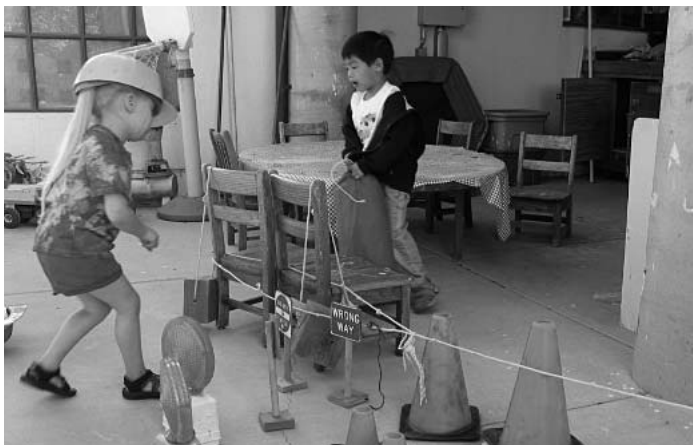
NANU CLARK MILLS COLLEGE CHILDREN'S SCHOOL