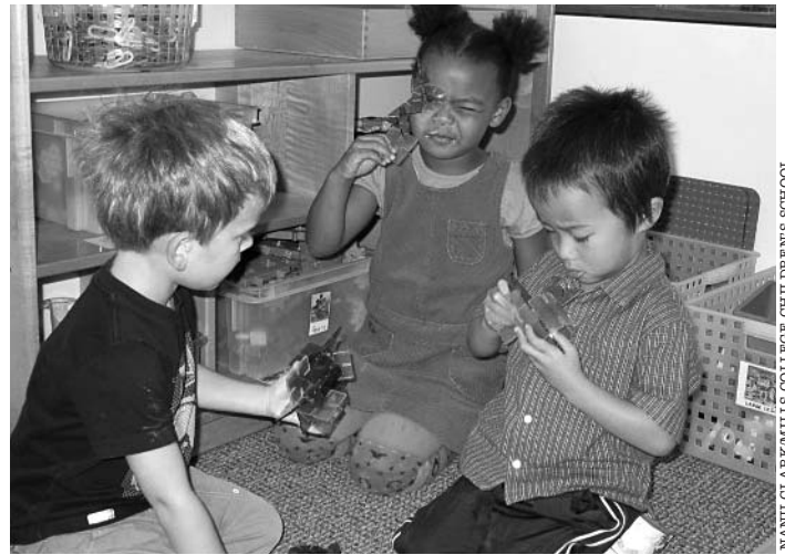
NANU CLARKMILLS COLLEGE CHILDREN'S SCHOOL